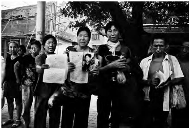
Petitioners hold letters of complaint in the "Petitioners' Village," which housed up to 4,000 petitioners in Beijing. It was torn down in the fall of 2007.

about a few historical and comparative matters. The book could have been improved by discussing more of the complex ways that ideas about rights (including the "now-you-see-it-now-you-don't" issue of gender equal-